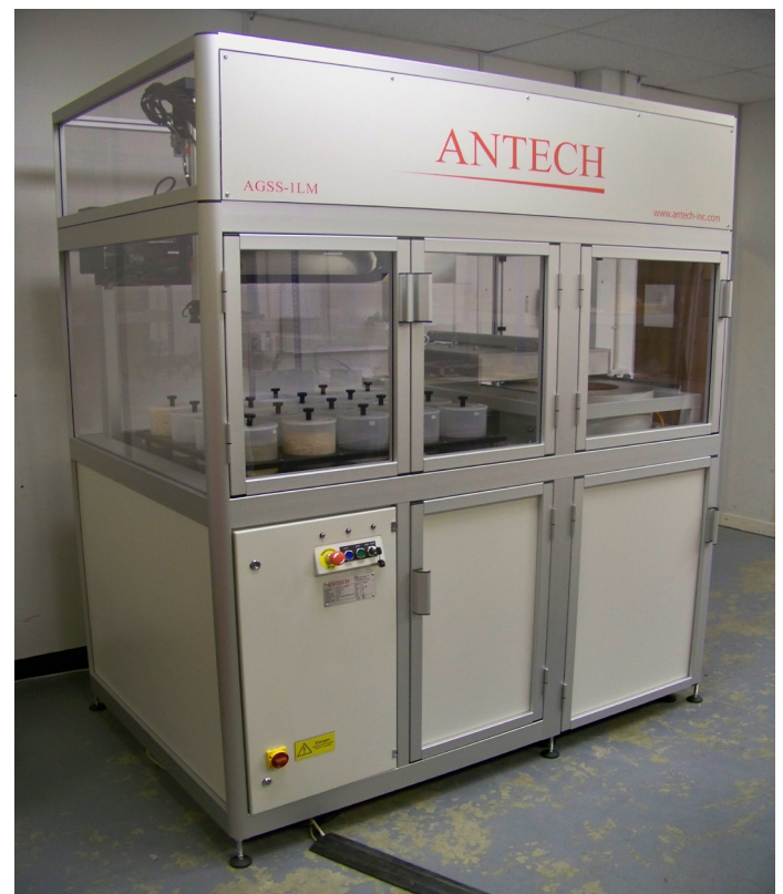
Fig 2. The ANTECH Model G3010-AGSS