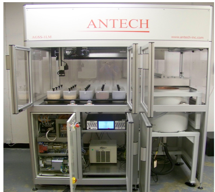
Fig 4. Access doors allow for ease of installation, batch preparation, maintenance and cleaning

The AGSS can be shipped as an almost complete package or in a flat packed configuration to accommodate any site access requirements or restrictions.