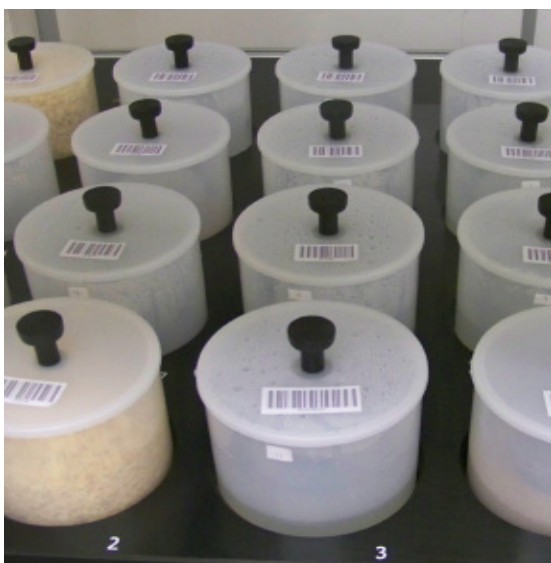
Fig 1. The sample tray with Marinelli beakers containing samples for measurement