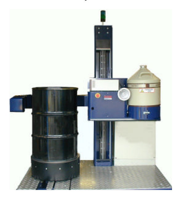
FIG. 1. The Tomographic Segmented Gamma-ray Scanner (TSGS) is designed to measure drums of up to 400 L with a maximum weight of 1500 kg.

Active and passive neutron measurements are performed by an advanced, graphite-lined DDA system. The DDA is an active and passive neutron measurement