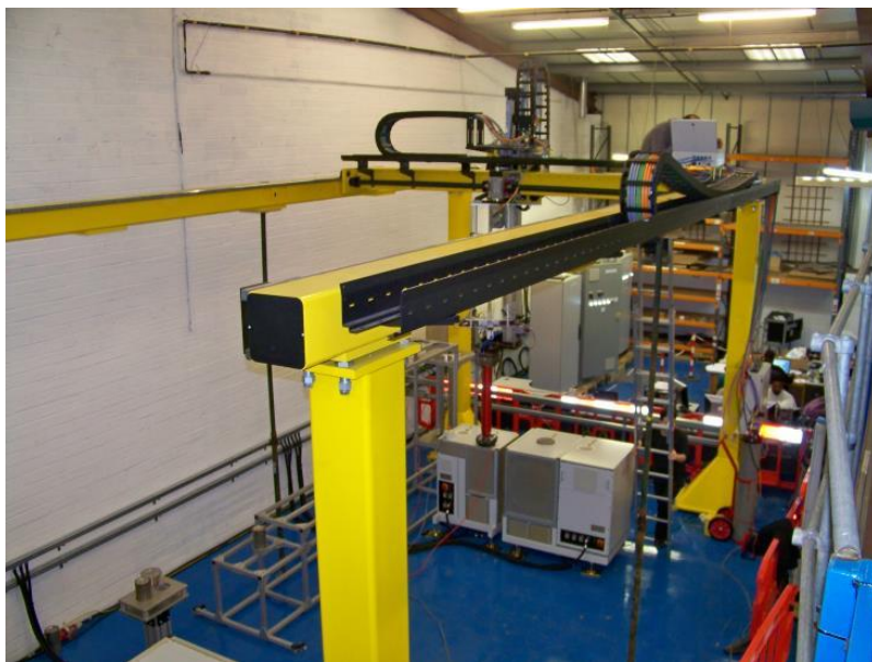
Figure 10. This photograph shows the testing installation of the MOX facility automated NDA system. In this test configuration the Gantry Robot is supported on four pillars. A thermal pre-conditioner (left) and a calorimeter (right) are positioned below the Gantry Robot. Note that the End Effector is moving a plug unit on a pre-conditioning unit.

All pre-conditioning units were tested using simulated 3013 product containers, which were heated externally to a range of different temperatures before pre-conditioning. The units were commissioned to operate at temperatures slightly above the calorimeter set point temperature to compensate for heat-loss during the transfer from the pre-conditioner to an available calorimeter. Calorimeter testing and the electrical calibration process have been described elsewhere, [2]. The absence of fissile material necessitated an alternative scheme for the testing of the Gamma ray Isotopic Ratio Measurement Systems. The HPGe detectors and data acquisition electronics were calibrated and commissioned with calibrated point sources including