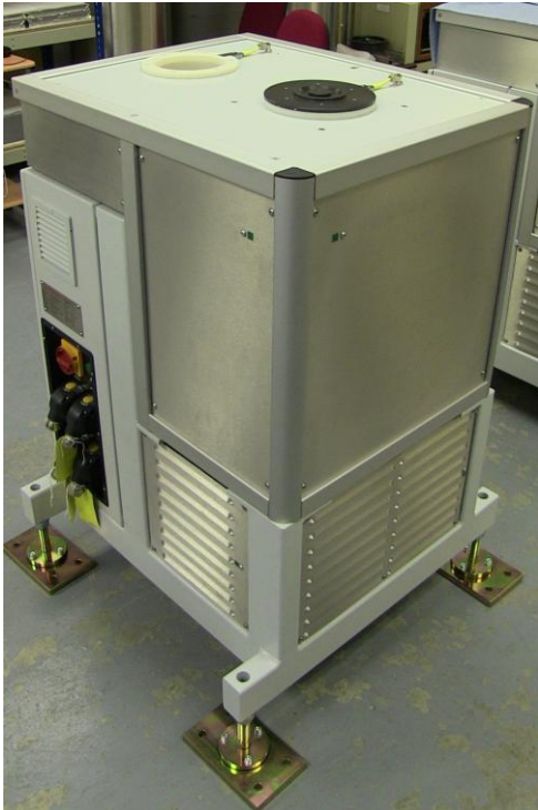
Figure 4. Thermal Pre-conditioner Unit

During storage and shipment, thermally insulated 3013 containers of plutonium can reach elevated temperatures in excess of 100 degrees C. As calorimetry is a thermal measurement process it is necessary to pre-condition such containers before measurement by the calorimeters. Ordinarily, calorimeter sample pre-conditioning or pre-heating as it is often known, is required to raise the sample surface temperature to match the calorimeter measurement chamber operating temperature, typically 25-30 degree C. For most of the samples that will be measured by the MOX calorimeters, the function of the pre-conditioners will be to reduce the surface temperature of the 3013 containers of plutonium.