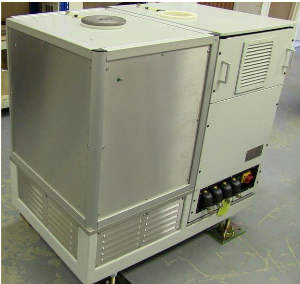
Figure 5. Model CD285-3013 Isothermal Calorimeter.

The heat or thermal energy produced by plutonium samples in 3013 containers is measured by calorimeters of novel design operated in the “Isothermal Mode”. The calorimeter design and operating characteristics have been described in detail in an earlier paper [2] so an abbreviated description of their operation is included in this section. One of the calorimeters is shown in Figure 5. Each Isothermal calorimeter consists of three concentric cylinders manufactured from aluminium alloy. Copper heater and nickel sense coils are wound around the outer surface of the middle and outer cylinders for electrical heating and temperature control.