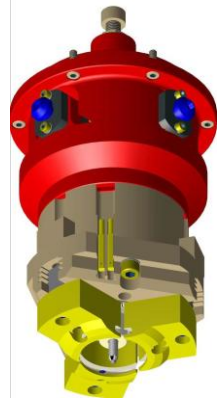
Figure 8. Gripper

Attached to the end of the Gantry vertical axis is a Schunk® pneumatically operated compensator permitting a limited amount of low friction travel in the X-Y plane when collecting containers specifically from the Input Conveyor and Lag Storage Racks. The compensator is locked centrally when depositing or receiving containers from other areas. Vertical movement is permitted at all times to ensure a positive location of the gripper.