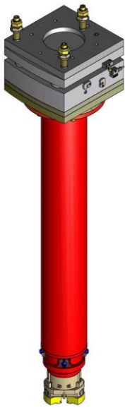
Figure 7. End Effector

A Compensating End Effector (Figure 7) was designed by ANTECH for the 3-Axis Gantry Robot to automatically process the 3013 containers with geometric tolerances greater than the original design limits for 3013 containers and also process the instrument plug units. A novel design approach was required to pick up containers with the pintle feature positioned at up to 1.5 degrees from true and to accommodate containers stacked 4 high within the lag storage racks with a build-up of tolerance in the height of the containers. For both the input conveyor and lag storage there is a lack of close fit location when the 3013 containers are collected. These factors necessitated a design that incorporates a long reach and an integral degree of movement in the X, Y and Z planes as well as pitch and yaw movement.