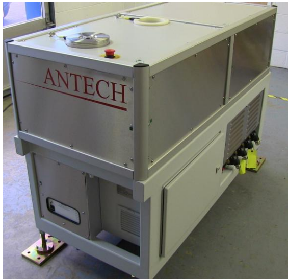
Figure 6. Gamma ray Isotopic Ratio Measurement System

A 3013-product container is placed by the Gantry Robot on a rotation platform in the lead shielded cylindrical chamber of the instrument. The lead chamber and the lead shielding plug unit have a graded liner of tin and copper to suppress the emission of lead X-rays. The HPGe detector views the fissile material (plutonium) in the product container through a variable aperture-shutter such that the full height of the container is in the detector crystal field of view. The width of the shutter is automatically adjusted to produce a count rate in the detector so as to optimise the HPGe detector dead time.