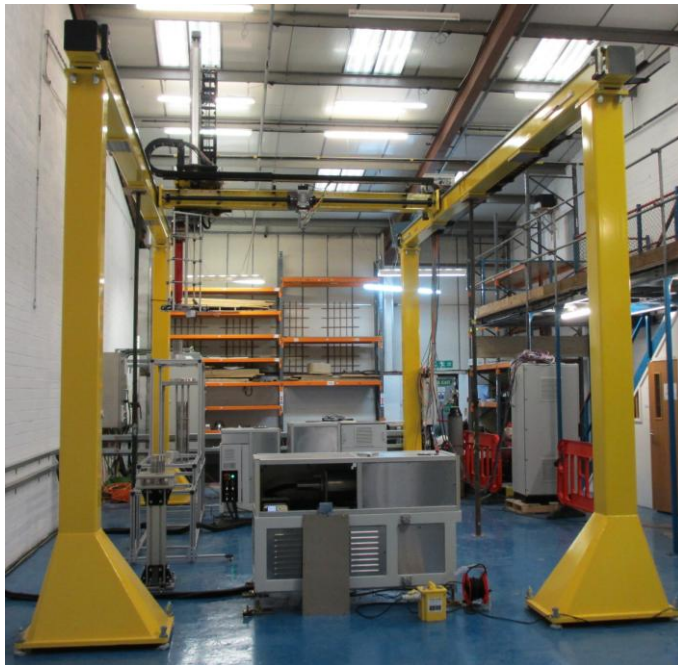
Figure 3. Pre-conditioner, Calorimeter and Gamma ray Isotopic Ratio Spectrometer positioned below the 3-Axis Gantry Robot during testing. The support pillars are only used for factory testing.

Calorimetry for the thermal power measurement of plutonium [1] combined with gamma ray isotopic ratio measurement is the basis of the measurement and assay process employed by the MOX facility for determining the fissile content of 3013 containers in which the input material is supplied to the facility. The measurement system is made up of three component instrument types, consisting of calorimeter