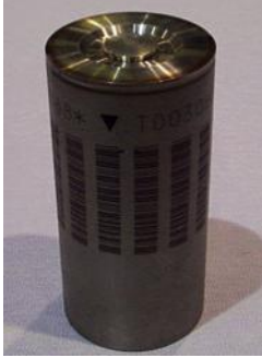
Figure 1. 3013 container

The MOX Services Normal PLC (programmable logic controller) provides supervisory control of the complete integrated NDA system as well as direct control of the Gantry Robot. A Measurement Control Computer (MCC) provides control and data analysis for the assay instruments and pre-conditioners. A Process Personal Computer (PPC) provides the link between the NPLC and the MCC. The PPC also communicates with the MOX Services network computers to upload assay result data files to MOX Services file servers.