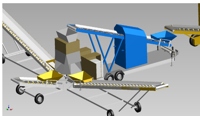
Fig 2. SMSS showing the input hopper and levelling bar (right) and the 3-way diverter (left)