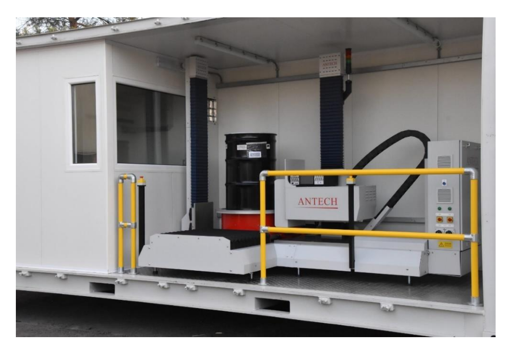
Fig. 1. UDASS mounted in an ISO shipping container. The operator control room is shown on the left. The photograph shows the UDASS mobile lab with a drum in the measurement position and the foldable side doors open.

The UDASS Mobile Assay Laboratory divides the ISO container into two separate areas; an operator control room and an assay area, where the UDASS is located. The internal areas were lined and subdivided with insulating panels designed for use in containers, to provide environmental protection and temperature stability throughout the measurement campaign. Within the operator control room, an UDASS operator can control, monitor and carry out measurements on the UDASS, as well as monitor the loading and unloading process being carried out by the N3B site operators, through two windows in the control room wall. An interlinked safety circuit enabled both the operator and the site team to halt the measurement process at any time through multiple emergency stop push buttons. The operator control room featured a desk, operator control console onto which the control and analysis software was loaded, an uninterruptible power supply (UPS) to hold up the UDASS critical supply voltage, and an HVAC unit (air conditioning) for operator comfort. To ensure the stability of the operating conditions of the UDASS instrument, the HVAC could be applied through the office wall to the UDASS assay area via a ventilation fan in order to heat/cool the assay area as necessary.