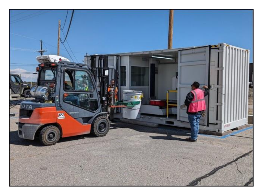
Fig. 2. The UDASS in operation in Area G of TA-54 at LANL. The photograph shows a TRU waste drum being loaded into the UDASS for measurement.

During the period from 18 March to 28 June 2024, the UDASS measured between 4 and 11 drums per day. The drums were loaded onto the drum rotation platform in the load position of the UDASS using a forklift operated by the N3B site team. After automated transfer to the measurement position of the instrument, the UDASS drum measurements were performed by the NVE operators, with advice were necessary from ANTECH. Once each drum measurement was complete the drum was repositioned to the load position from where it was removed by forklift and then return to storage. Figure 2 shows a waste drum being loaded into the UDASS.