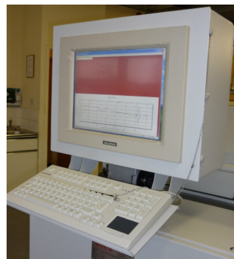
Calorimeter workstation based on Panel PC