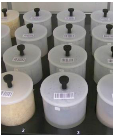
Fig 1. The sample tray with Marinelli beakers containing samples for measurement