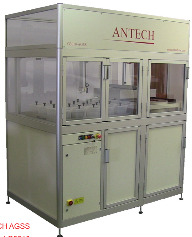
Fig 2. The ANTECH AGSS Model G3010