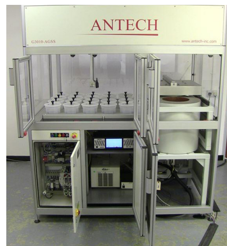
Fig 4. Access doors allow for ease of installation, batch preparation, maintenance and cleaning

The AGSS can be shipped as an almost complete package or in a flat package configuration to accommodate any site access requirements or restrictions.